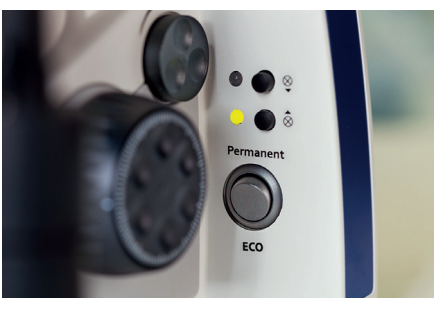
Ergonomic operating concept: Axioscope controls